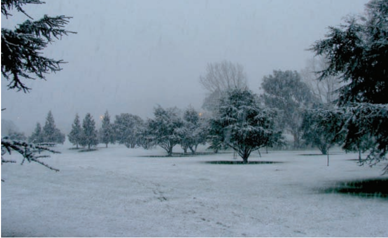
Avalon Park in the snow