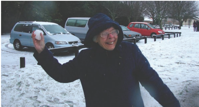
This is fun ... throwing snowballs