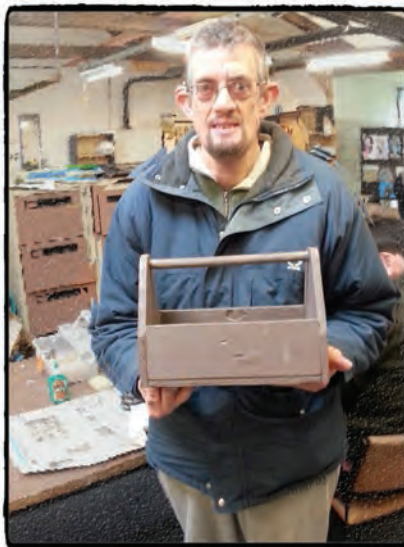
With my toolbox

Over the last year I have become a lot more connected with my Lower Hutt community. Upon meeting me your first impression will most likely be of my quiet, unassuming nature. But you would soon find that I am handy at woodwork, as my toolbox here shows.