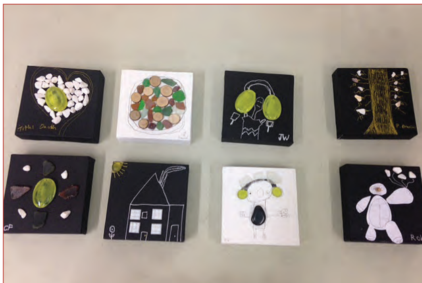
The lovely art we made