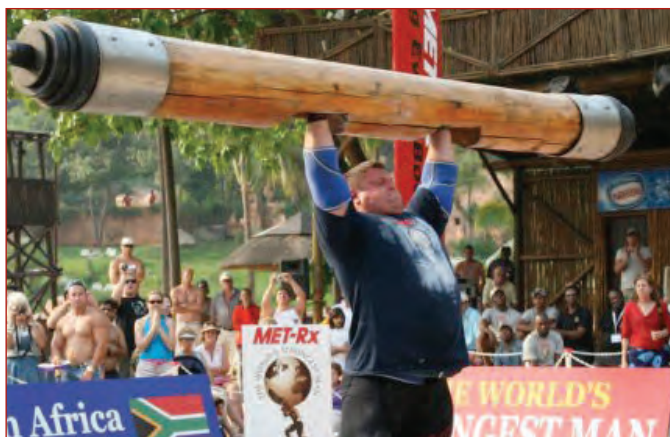
A competitor in a strongman competition

Whenever Earthquake used to get pinned in a wrestling match he always pushed his opponent off instead of rolling onto his shoulder before the referee counted to three.