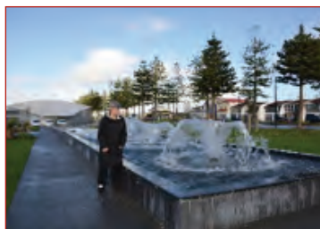
Taking in the sights along Marine Parade