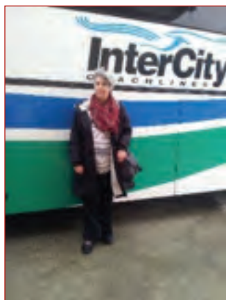
Leaving Wellington – first bus trip taken in NZ

Over the four days we ventured into town. We had a good look around the shops, enjoyed lunches in some of the lovely cafes and walked along Marine Parade.