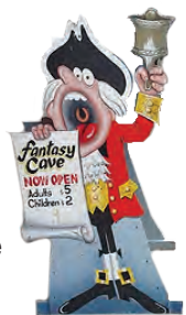
Sign outside the cave

We caught the bus from Hastings to Dannevirke and back again. The bus trip was a beauty, I couldn't have asked for a better ride or driver. We sang and also played 'I spy my little eye' to pass some of the time. Overall it was one fantastic day.