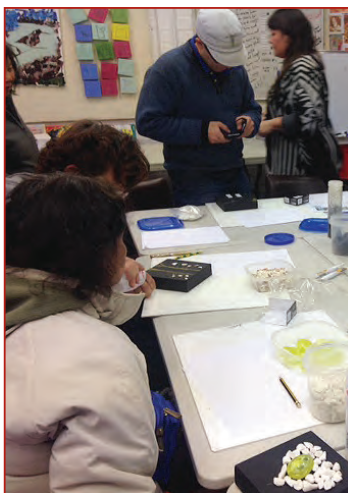
At the art table

We used pebbles and stones of various shapes and colours for our art. We each came up with a design, then glued our stones onto our canvas. It was a different experience for many of us, but lots of fun. Our art is now for sale at the Art Mart – check it out if you get the chance!